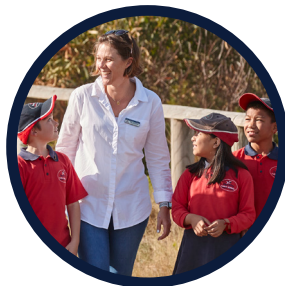
Build skills through fun